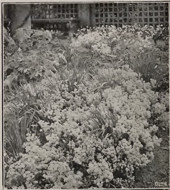
ALYSSUM SAXATILE COMPACTUM

* Serpyllifolium (Alpestre). Very dwarf. 4 to 5 in. high, with racemes of pale yellow flowers and rough, hoary leaves. Charming for the rock garden. Flowers just after Saxatile is out of bloom. 25c. each, $1.80 per 10, $12.00 per 100.